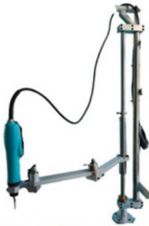
FLEXIBLE ARM FOR ELECTRIC SCREWDRIVER