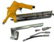
DB-B-36-6 Air Grease Gun Kit