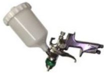
D B-SG- 04 H V L P Air Spray Gun